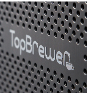
Stainless steel enclosure