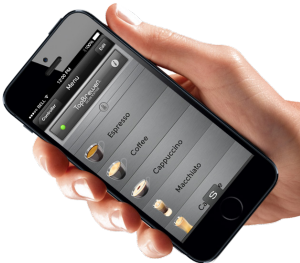
Customize your drink